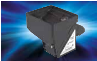
High Capacity Bowl