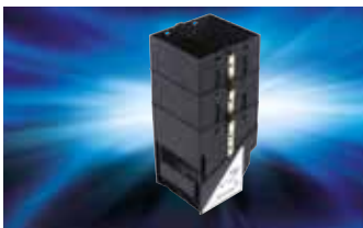
Square Bowl 2x Ext